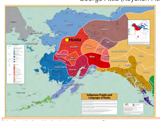
Huslia, Alaska. Alaska Native Language Center.